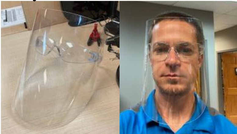
Fits Most Standard Safety Glasses!