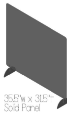
35.5" w x 31.5" t Solid Panel