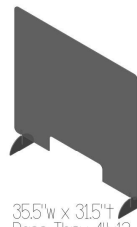
35.5" w x 31.5" t Pass Thru 4"x12"