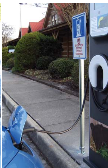
3. Plug cable from the charging unit into the car’s port