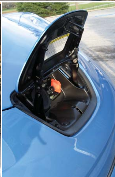
1. Pull into the charging space; 2. Open the charging port hatch